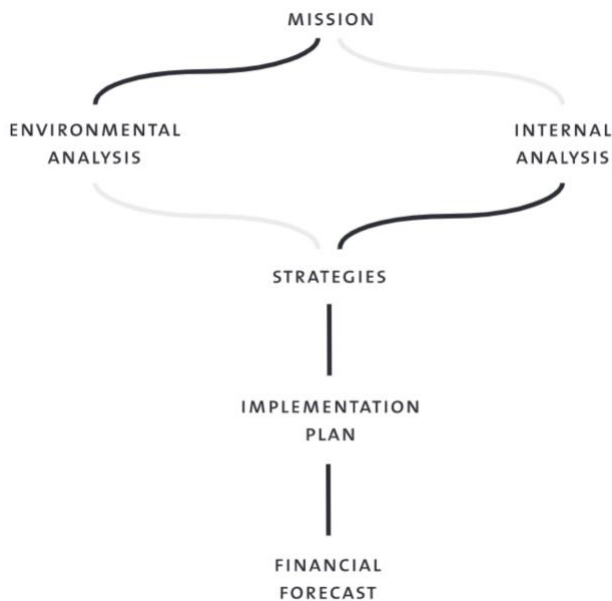
Strategic Planning Process Model